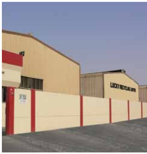
The Lucky Group's recycling facility in Jebel Ali Free