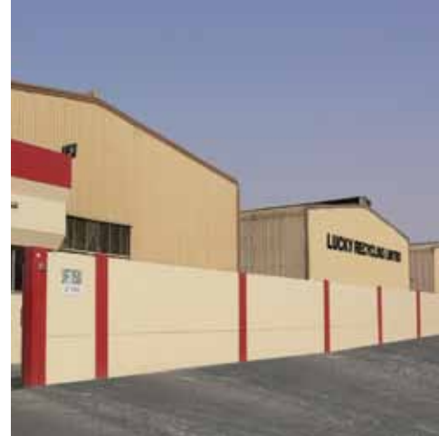
Zone - Dubai, United Arab Emirates